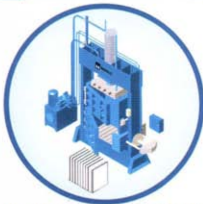
100 TON COTTON & COTTON WASTE SEMI AUTOMATIC BALING PRESS